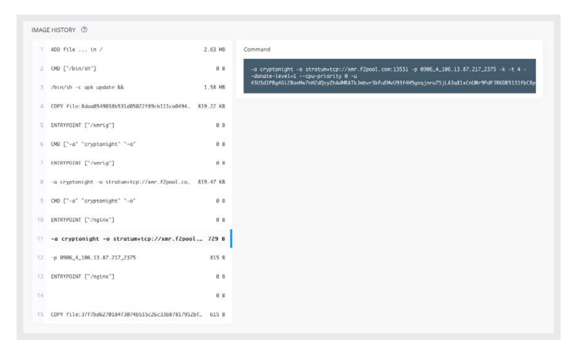
Figure 3. An example of a fake Nginx image that is actually an XMRig

Container images of popular software can be found on Docker Hub, a default place where images are pulled from when using Docker. Still, caution should be exercised while pulling uncertified or unverified images. Previously, 17 backdoored images were found inside the Docker Hub repository. Hence, a Dockerfile should also be verified when using untrusted images.<sup>10</sup>