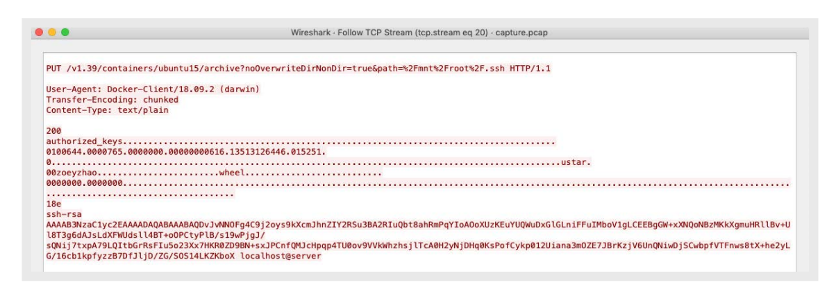
Figure 6. Putting a custom authorized key inside a mounted filesystem

This is not an example of default behavior nowadays, although it is still applied by some users. From a security perspective, exposing the Docker daemon to TCP port 2375 with no authentication or TLS encryption is equivalent to giving away hardware resources at the free disposal of anyone who gains access. The daemon accepts JSON requests over HTTP without authentication, thus allowing a malicious user to spawn a privileged container on the host that can be used for full host escape under root permission. Our telemetry captured an attempt to overtake a host by spawning a privileged container, mounting a host root filesystem ("/"), and rewriting the /root/.ssh/authorized_keys file.<sup>14</sup>