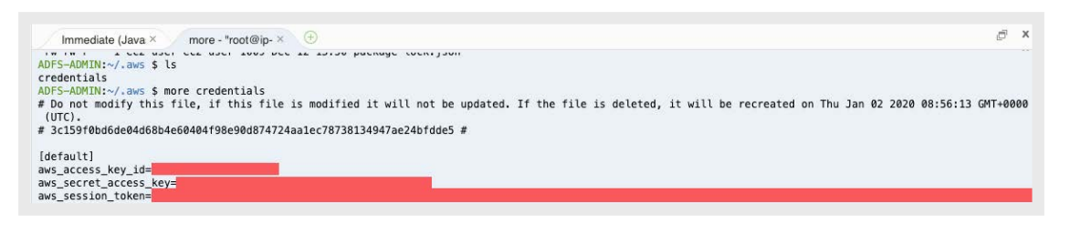
Figure 9. Access token storage inside a linked environment

Inside the linked environment, a user typically stores a hidden provider configuration together with workspace-specific configurations, such as source code management (SCM) provider settings (like git configuration), access tokens, and source code clone.